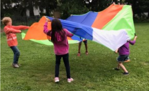
VASP kids enjoy parachute play

The Varna After School Program (VASP) will open for the 2021-2022 school year on September 10, 2021. We have space for children enrolled in Kindergarten through Fifth Grade. VASP runs from 2:00pm to 5:45pm, Monday-Friday. Ithaca City School District buses transport students from school to VASP. Please enroll your children by August 31st so we can prepare our staff, lesson plans, order supplies, etc. Our website VarnaAfterSchoolProgram.com has more information and can start you on the registration process.